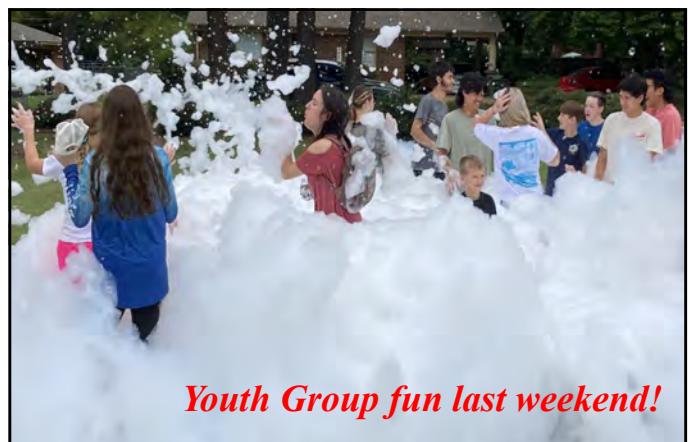
Youth Group fun last weekend!