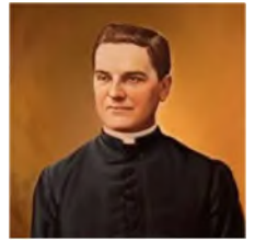
Blessed Father Michael McGivney