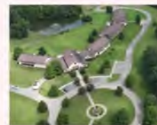
Our Lady Queen of Peace Retreat Center

Christ is counting on you - will you say yes?