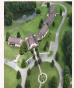
Our Lady Queen of Peace Retreat Center

Christ is counting on you - will you say yes?