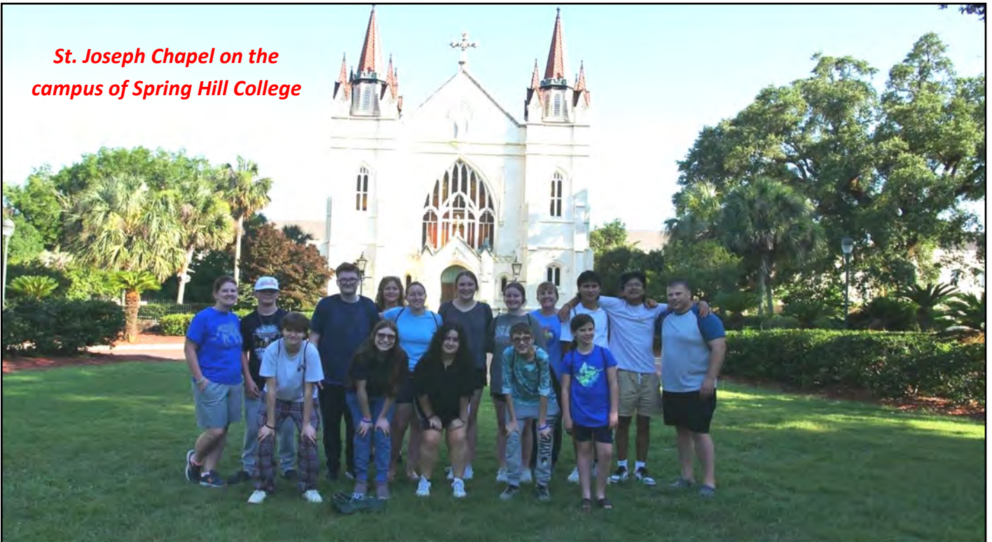
St. Joseph Chapel on the campus of Spring Hill College

For this year's summer trip, the youth group went to Alive In You Mobile, AL. The camp was broken up into 2 parts: working with an organization in need and youth conference. Part of our group put on an art camp for kids and the rest packaged diapers for the Junior League's Diaper Bank. This was a week-long camp where we spent most of every day on our service projects and our nights were focused on the youth conference. We stayed at a Catholic college in Mobile, along with over 300 other teens, and attended mass every day. We had a free morning one day where we went to the beach.