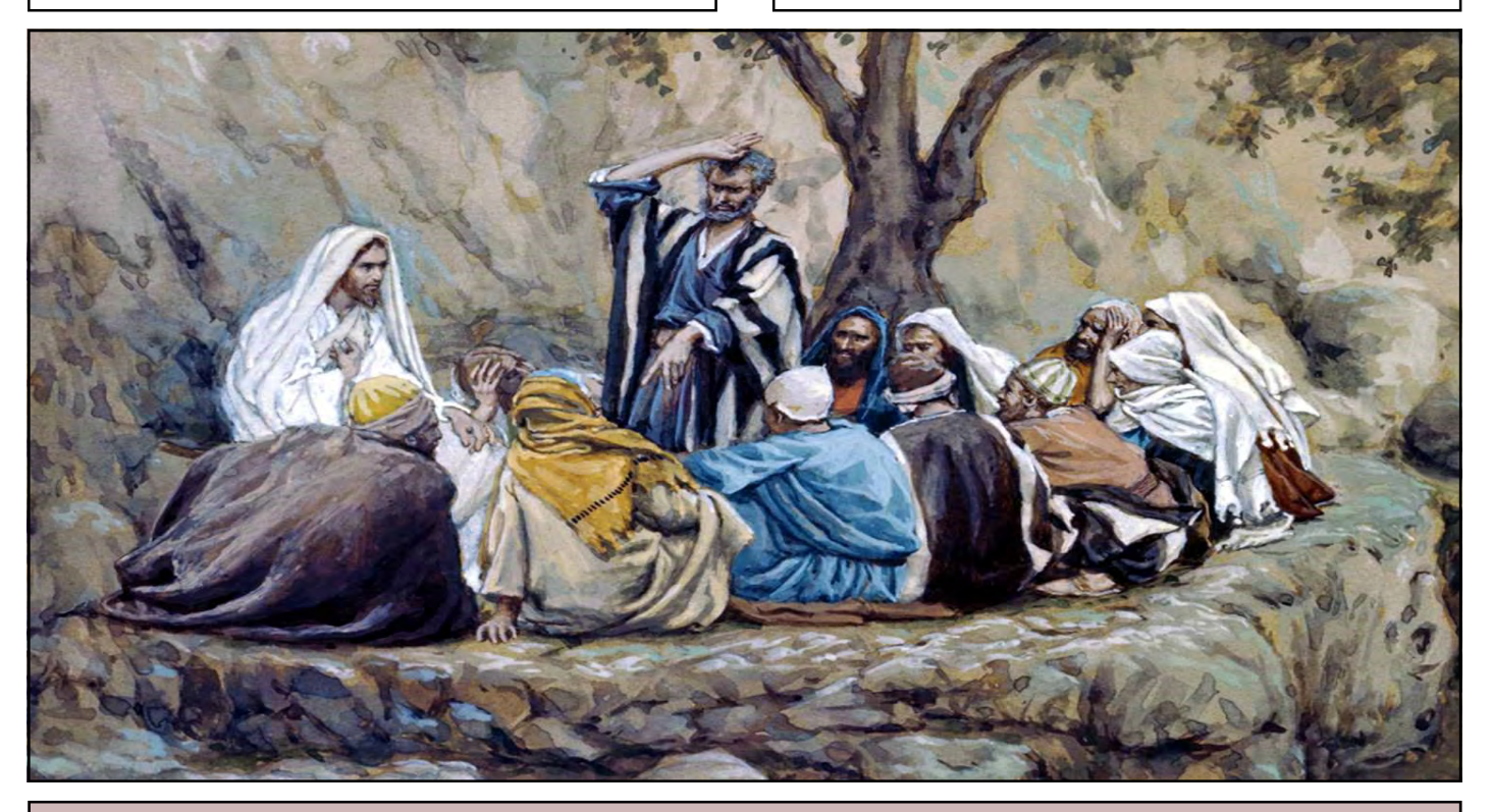
July 21, 2024 ~ Sixteenth Sunday in Ordinary Time

By appointment - Parent Class required and must be registered three months in the parish.