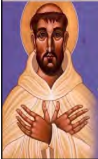
ST. WILLIAM OF VERCELLI June 25th

Please bring a dish and join us for a parish wide potluck Saturday, June 29th after 4:30 Mass in the Family Life Center..