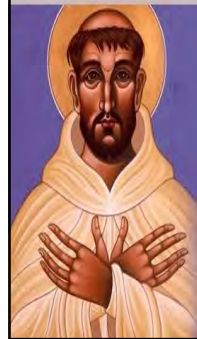
ST. WILLIAM OF VERCELLI

Please bring a dish and join us for a parish wide potluck Saturday, June 29th after 4:30 Mass in the Family Life Center..