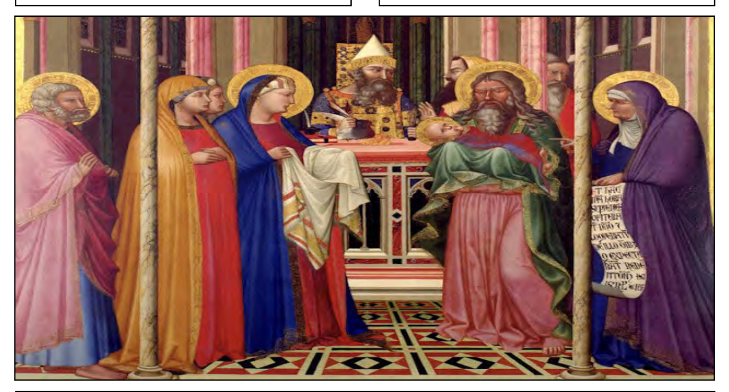
February 2, 2025 ~ The Presentation of the Lord

BAPTISM By appointment - Parent Class required and must be registered three months in the parish.