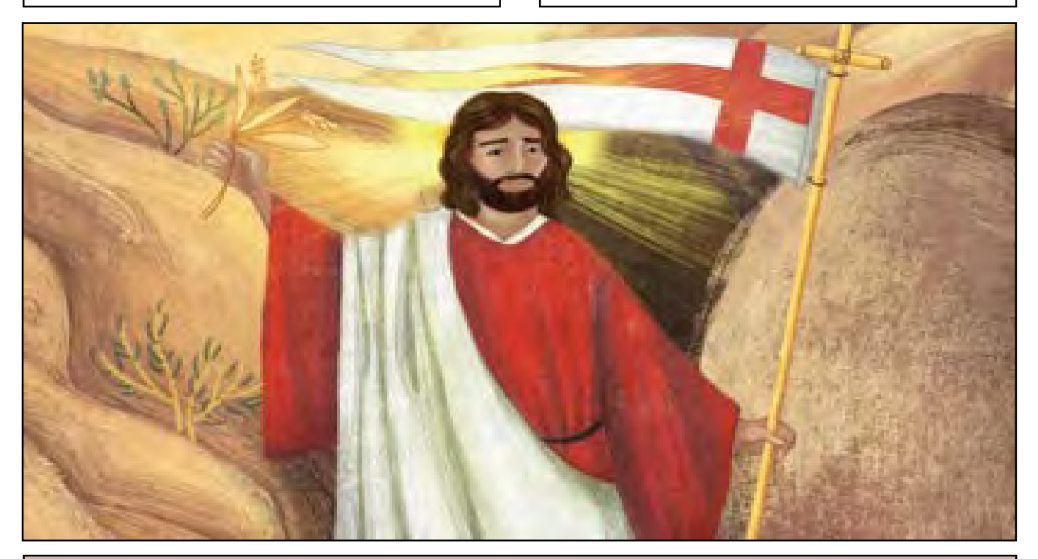
April 28, 2024 ~ Fifth Sunday of Easter

BAPTISM By appointment - Parent Class required and must be registered three months in the parish.