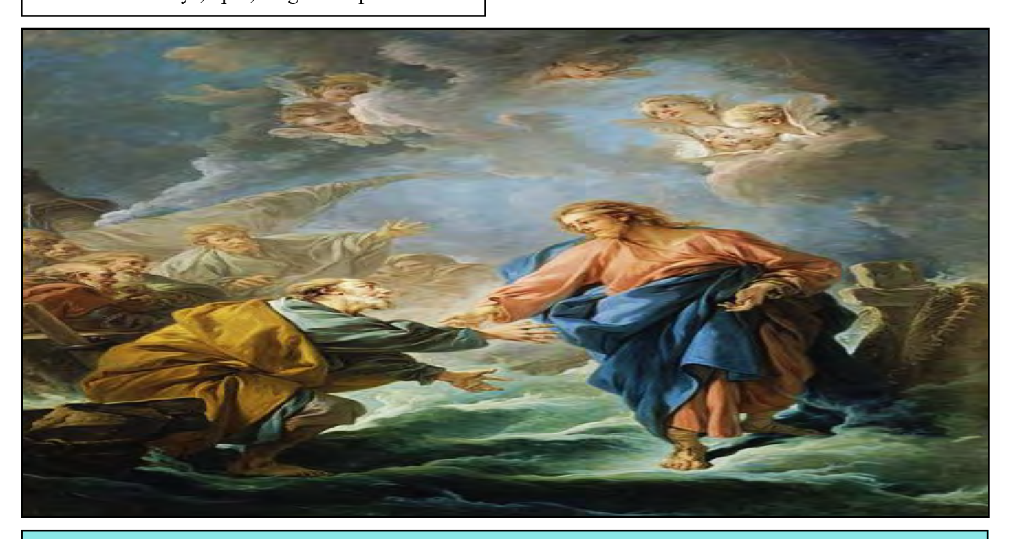
August 13, 2023 ~ Nineteenth Sunday in Ordinary Time

By appointment - Parent Class required and must be registered three months in the parish.