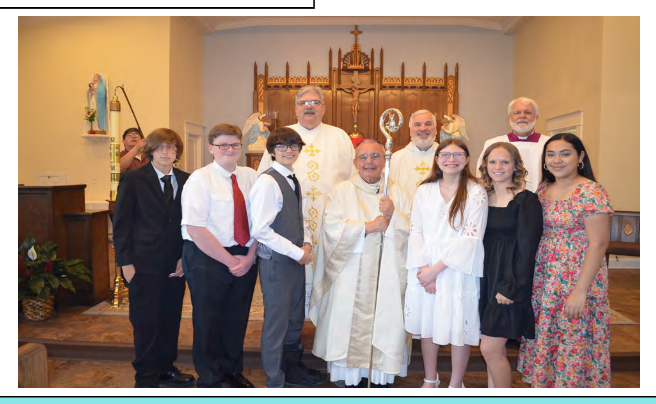
May 14, 2023 ~ Sixth Sunday of Easter

BAPTISM By appointment - Parent Class required and must be registered three months in the parish.